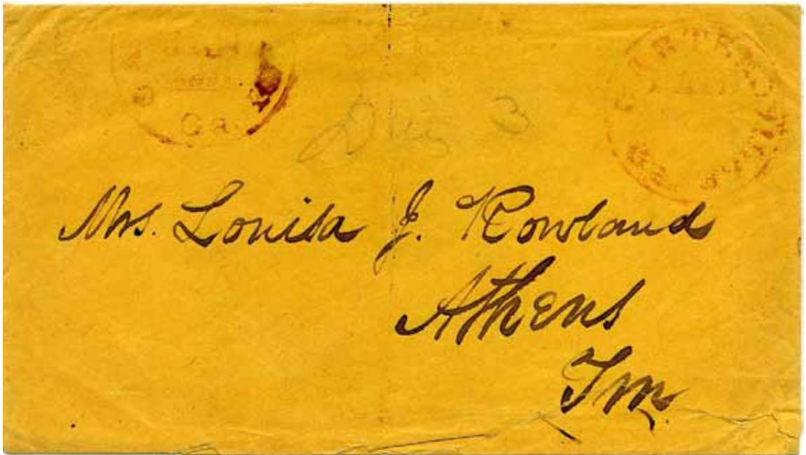
Figure 1: Cartersville, Georgia, (five-cent) red handstamped provisional entire (CSA Scott 126XU1) with 'Due 3' applied in pencil, as the Confederate rated postage was not recognized in Tennessee in early June when Tennessee was still under U.S. postal control.